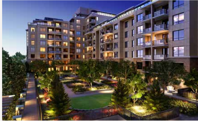
BRIDGELAND CROSSINGS Calgary, AB