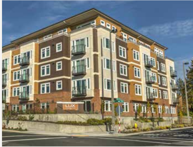
LUX APARTMENTS Bellevue, WA