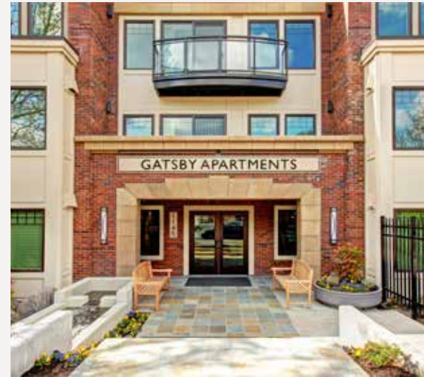
GATSBY APARTMENTS Seattle, WA