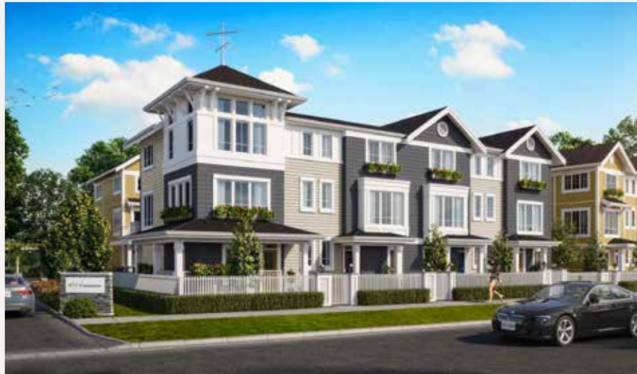
WEST COMMONS TOWNHOMES Colwood, BC